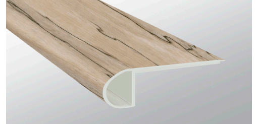
* Stair Nose (Flush)