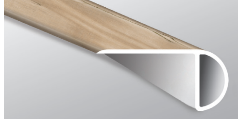
Stair Nose (Overlapping)